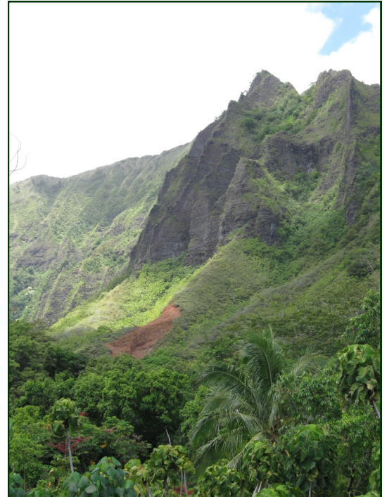
View of Koolau Mountains

It's been an exciting year for the O'ahu RC&D. We launched ten new projects addressing watershed protection, agricultural tourism, conservation easements, and agricultural development. We wrapped up three agricultural development and vetiver projects, and we continued ongoing efforts including cover crop promotion, watershed management, agribusiness training, and agricultural development.