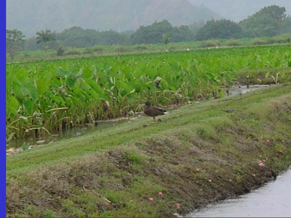
Koloa Duck in Taro Lo'i.