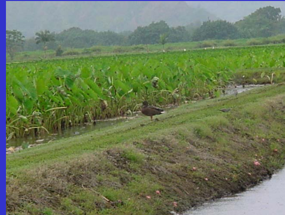
Koloa Duck in Taro Lo'i.